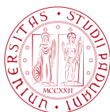
UNIVERSITÀ DEGLI STUDI DI PADOVA